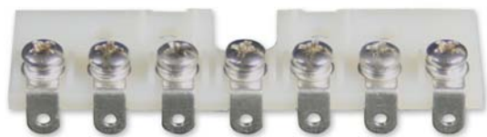
Terminal Board - screw type terminals. Facilitates "in-field" wiring hook-up.