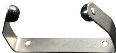
Retaining Clip - Locks the handset in place