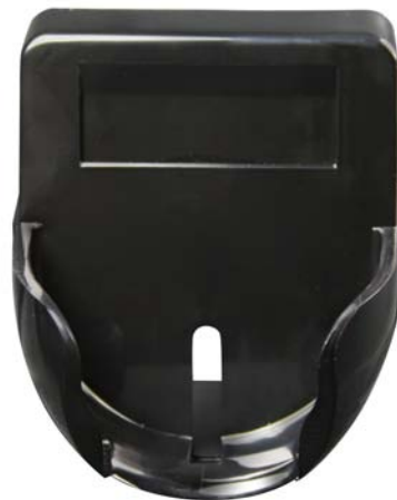
Cradle with slot for use with mechanical leaf switch