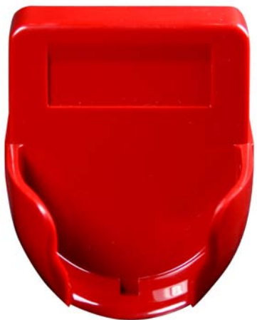
Cradle, less slot for use with magnetic reed switch

Rugged cradles accommodate "G" type handsets. They may be purchased as separate component parts, factory assembled units, or pre-wired handset and cradle components.