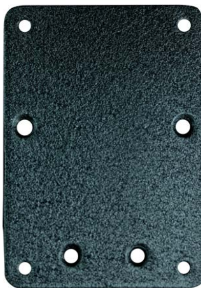
Mounting Plate - Facilitates wall mounting applications